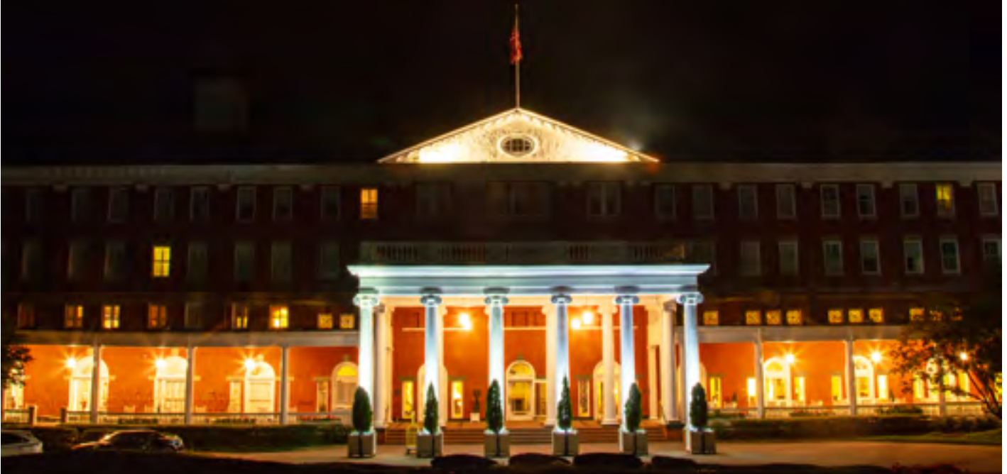
At the Homestead Resort in Hot Springs, VA the difference is night and day.