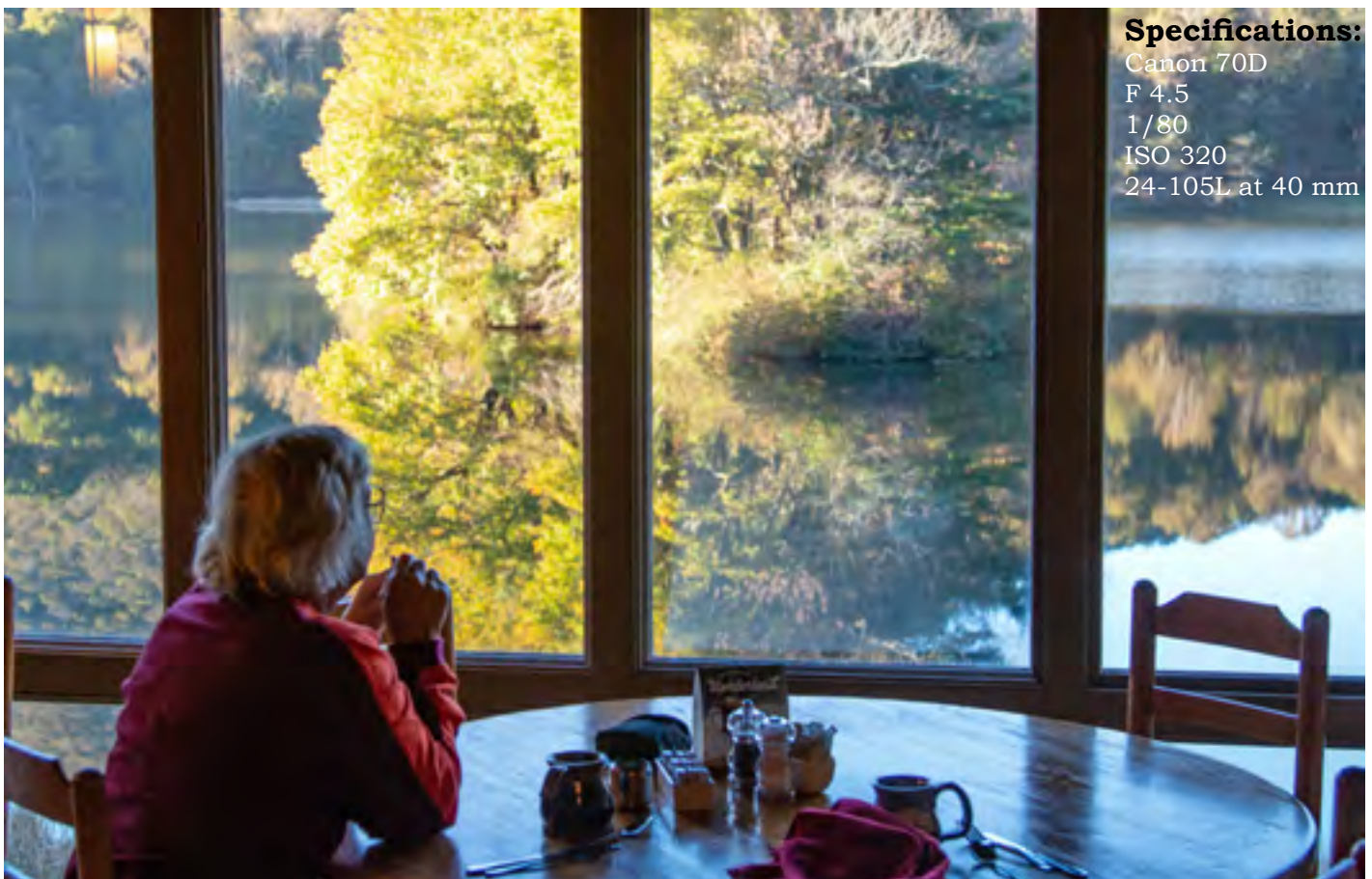
At Peaks of Otter Lodge, view outside and inside. Both have their advantages.

Canon 70D F 7.1 1/100 ISO 100 24-105L at 24 mm